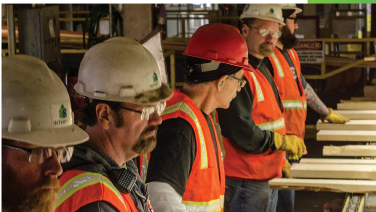
Knowledgeable people in key positions ensure products meet or exceed grade standards

The highest finish quality of any board in North America