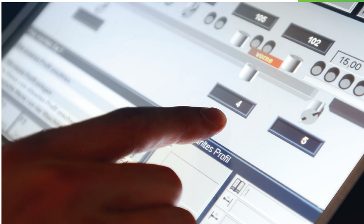
PowerCom Moulder Control System provides accurate and precise set-up