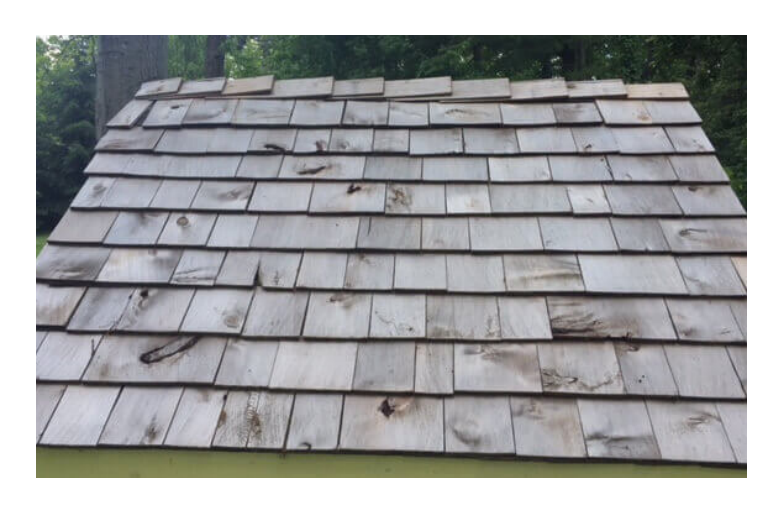
#4 Undercourse Shingles Designed to be a starter layer to build your shingle or shake roof on.