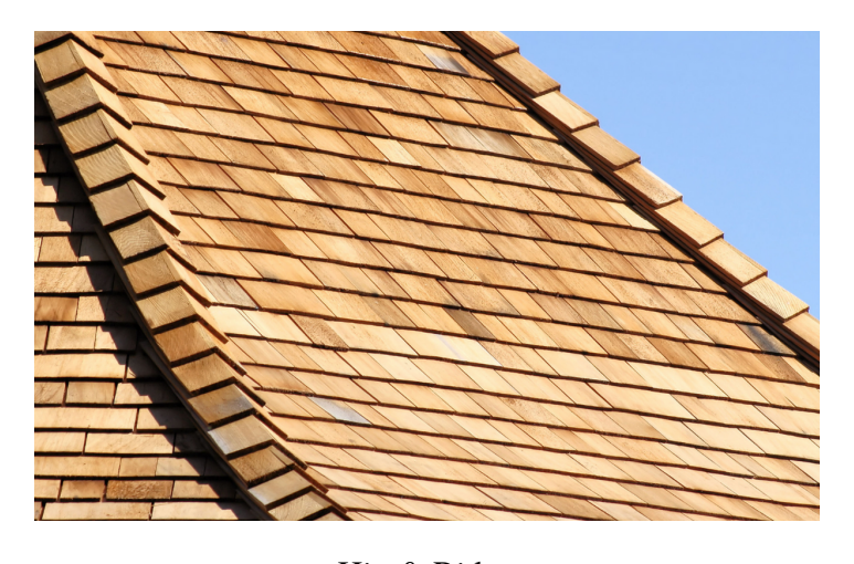
Hip & Ridge 24" Long, uniform tapersawn works for both shingle or shake roof.