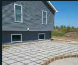
PATIOS & DECORATIVE