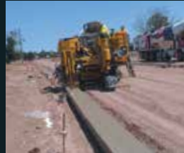
CURB & GUTTER