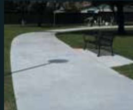
HIKE & BIKE TRAILS