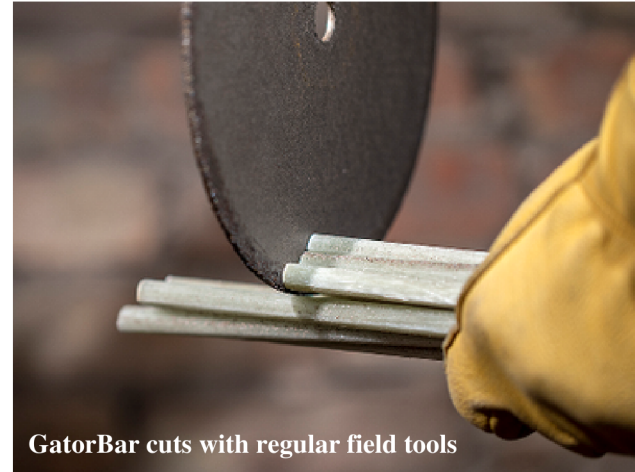
GatorBar cuts with regular field tools