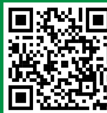
HZ5 INSTALL CHECKLIST