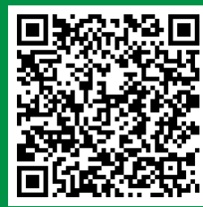
HZ5 WARRANTY INFO

Quick Reference for materials needed to do a residential siding installation.