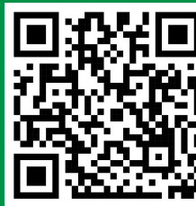
HZ5 INSTALL MANUAL