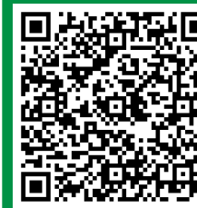
HZ5 CLEARANCE GUIDE