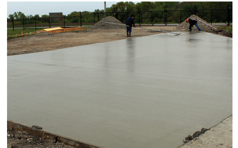
6. On to the Next Job!