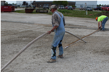
1. Lay & Space